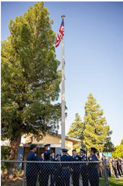
Patriot Day Commemoration at Duncan Polytechnical High School