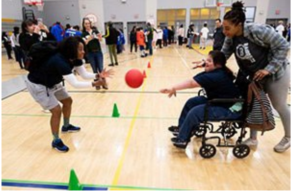
Special Olympics Basketball at Gaston Middle School