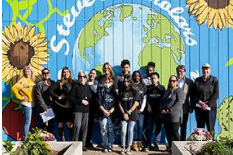
Steve's Scholars Community Garden Rededication November 17