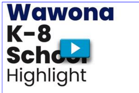
Wawona K-8 School Highlight Video