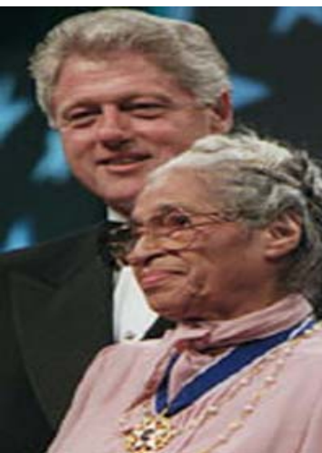
In 1996, U.S. President Bill Clinton awarded Rosa Parks the Presidential Medal of Freedom.