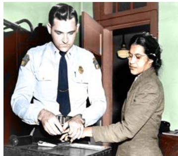
Rosa Parks was arrested for Civil Disobedience on December 1, 1955.