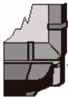
Ready Light on right side of pen tray

The Ready Light indicates the status of your interactive whiteboard. Depending on the model of the SMART Board interactive whiteboard you are using, the Ready Light is located either on the right side of the pen tray or the lower-right of the frame bezel.